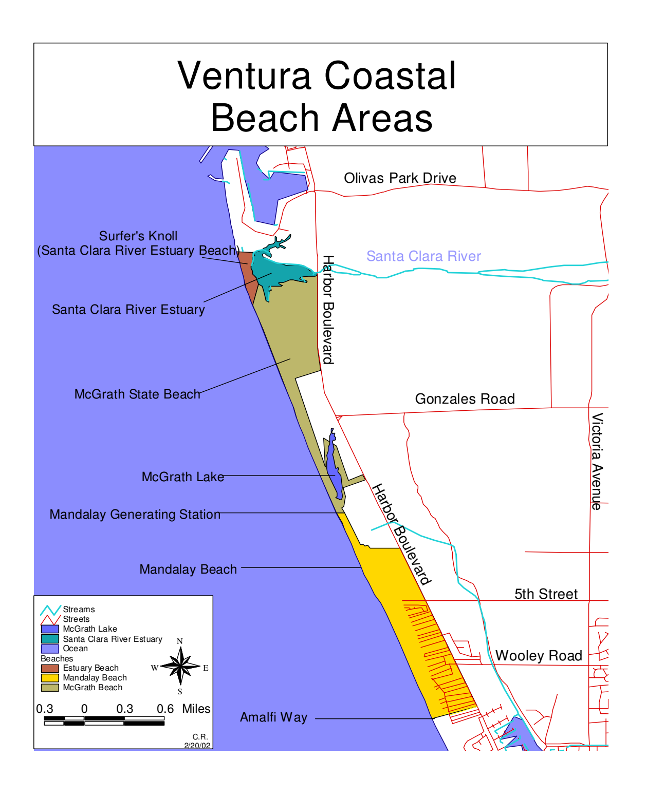
FIGURE 1. MAP OF SURFERS' KNOLL, MCGRATH BEACH, MCGRATH LAKE, AND MANDALAY BEACH